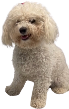
BEFORE Cristal Clean