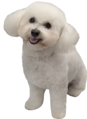
AFTER Cristal Clean